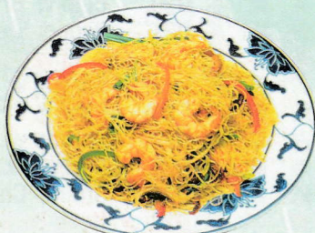
Singapore Chow Mei Fun