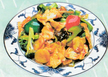
Chicken w. Garlic Sauce