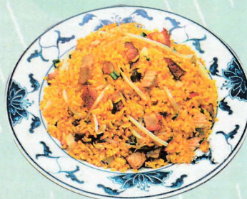
Roast Pork Fried Rice