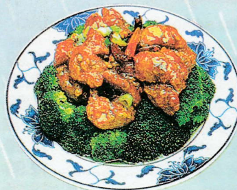
General Tso's Chicken